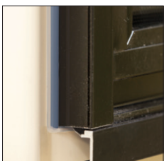
Side view with Trim Bead