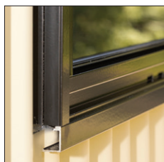
With Trim Bead Extension Note: Installation depends on your cladding position