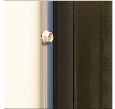
Side view with Trim Bead